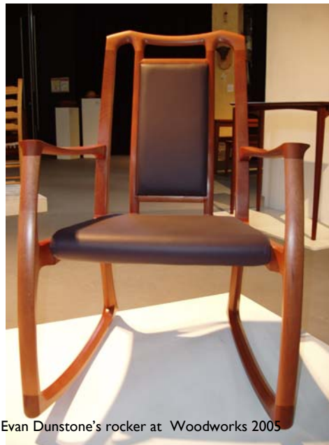
Evan Dunstone's rocker at Woodworks 2005